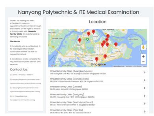
2. Select which Pinnacle Clinic you wish to visit