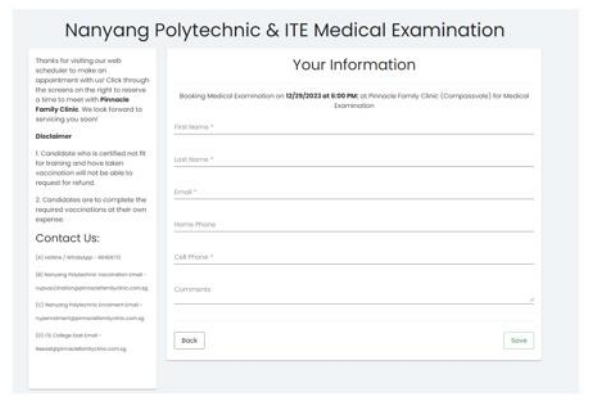
4. Provide your name and contact to complete the booking of your appointment