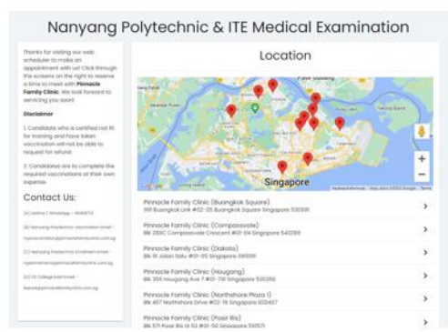
2. Select which Pinnacle Clinic you wish to visit